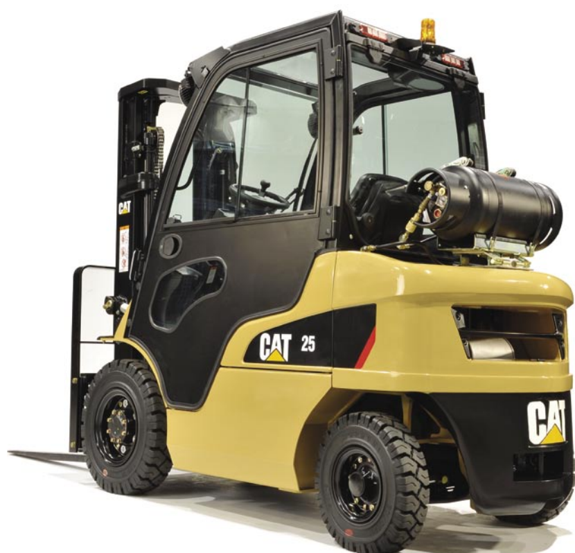
Panel Cabin with Steel doors