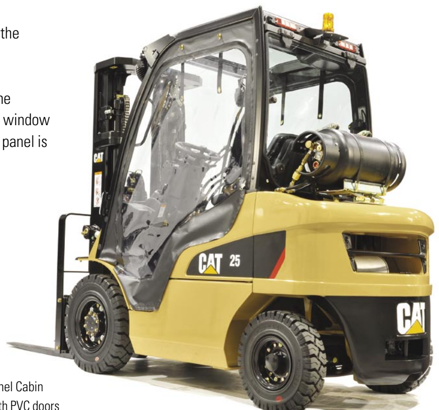
Panel Cabin with PVC doors